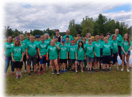
Stayin' Alive Day Camp Week 2: 11-14 year olds