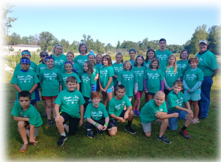
Stayin' Alive Day Camp Week 1: 8-10 year olds

MSU Extension 4-H partnered with Gahagan Nature Preserve, Family Fare, Hanson Hills, and the Crawford Partnership for Substance Abuse Prevention to provide two sessions of a free 3-day summer day camp to Crawford and Roscommon County youth. Participants learned important survival skills such as seeking shelter, orienteering, fire building, and more. Following the camp, because of our partnership with the Crawford Partnership for Substance Abuse Prevention, Crawford County 4-H received gift funds to support future programs.