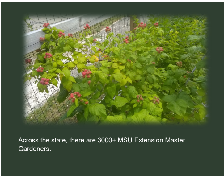
Across the state, there are 3000+ MSU Extension Master Gardeners.

From learning forestry practices, enhancing wildlife habitats and the impact of local forestry services at the Forestry & Wildlife Expo to monitoring data on Sentinel trees and learning to identify forest pests at Eyes on the Forest, from clean water education to a bio-mass thermal tour and providing forestry education and camps to local students, almost 200 Crawford County residents have participated in natural resources education.