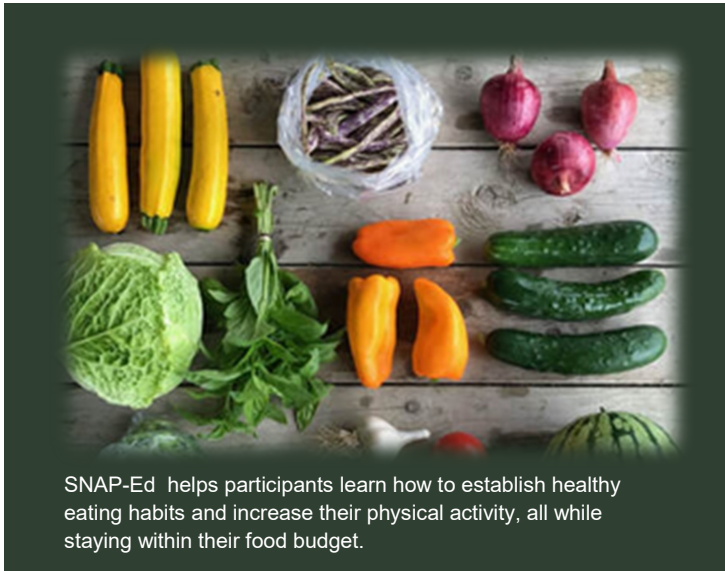
SNAP-Ed helps participants learn how to establish healthy eating habits and increase their physical activity, all while staying within their food budget.