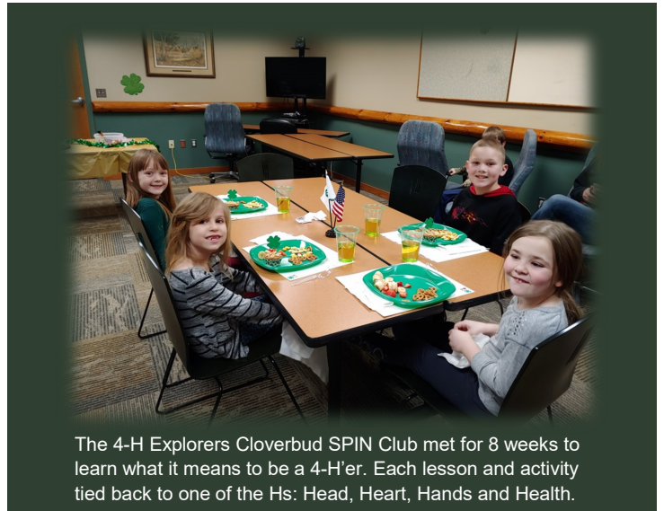
The 4-H Explorers Cloverbud SPIN Club met for 8 weeks to learn what it means to be a 4-H'er. Each lesson and activity tied back to one of the Hs: Head, Heart, Hands and Health.

4-H is the nation’s largest youth development organization with programs in every Michigan county, including Crawford. 4-H believes in the ability of youth to not only be the leaders of tomorrow, but to be leaders today in their own communities. Through participating in a variety of clubs, camps, and other special events, youth can increase their knowledge about topics that interest them and learn by doing. In 2019, 703 youth in Crawford County participated in 4-H programs with 80 youth being individually enrolled in local clubs and camps.