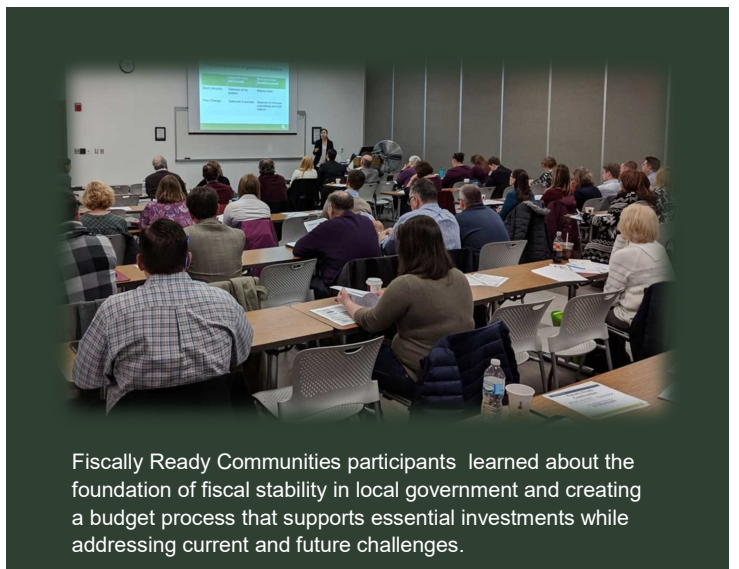
Fiscally Ready Communities participants learned about the foundation of fiscal stability in local government and creating a budget process that supports essential investments while addressing current and future challenges.

In 2019, programs like Citizen Planner, Understanding Citizen Redistricting, Building a Better Budget in Local Government, The Impact of Federal Politics on Local Government, and Opportunity Zone education were amongst the most popular locally. Over 21 MSU Extension Educators worked to provide this programming to Crawford County residents.