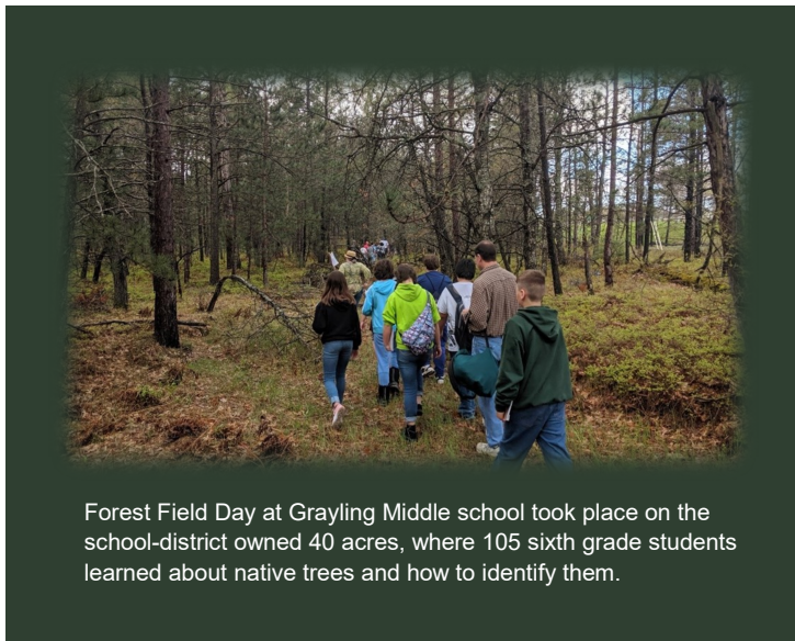
Forest Field Day at Grayling Middle school took place on the school-district owned 40 acres, where 105 sixth grade students learned about native trees and how to identify them.

Through a Blue Cross Blue Shield Health Community grant, instructors were able to provide grade-level assemblies to Crawford-AuSable School District K-5th grades and support their Healthy Kids Club efforts. Other program partners included Shawono Juvenile Detention Center, Juvenile Probation, Grayling High School Viking Food Pantry & Crawford County Commission on Aging.